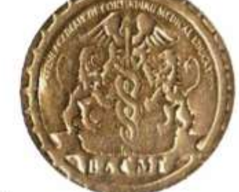
Chair, Committee for Review & Recognition